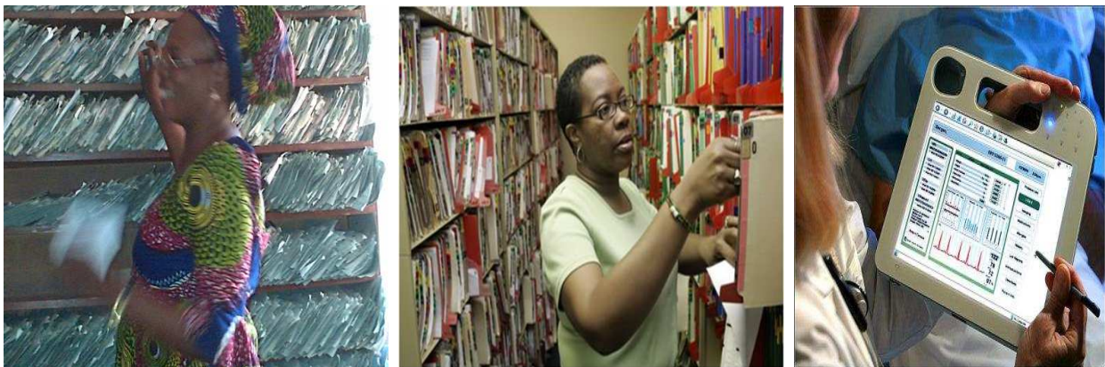
Fig. 1. L-R: A typical Nigerian paper-based health records system, manual filing in developed nation and a glimpse into an electronic health records system aided by ICT.

Similarly, the availability of ICT has provided the possibility of immediate and unprecedented access to the most recent and reliable results of clinical research and health information in everyday medical practice in developed countries [17-18]. Widespread adoption of ICT is a key strategy to meet the challenges facing health systems internationally of increasing demands, rising costs, limited resources and workforce shortages. Despite the rapid increase in ICT investment, uptake and acceptance has been slow and the benefits fewer than expected. For example, Kale [19] established that most healthcare professionals in developing countries had inadequate access to information and that the little information available to them was often unreliable and irrelevant. Similarly, Dorsch [20] submitted that rural healthcare providers were constrained by stemming barriers in spite of the fact that they needed basic information like their colleagues in the urban centres.